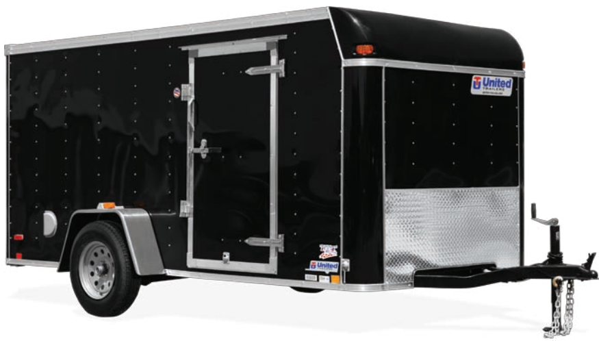
6' x 12' UMT500