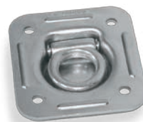
Heavy Duty "D" Ring