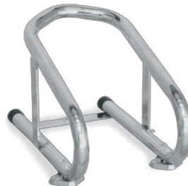
Removeable Wheel Chock