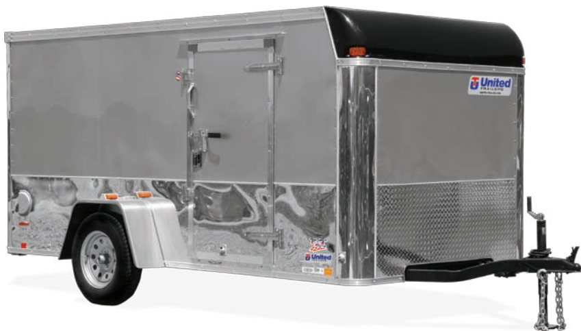
6' x 12' UMT1000