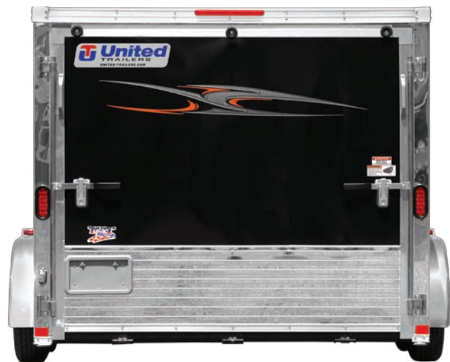
7' x 16' UMT2000

Call us to find a dealer near you at 800-637-2592