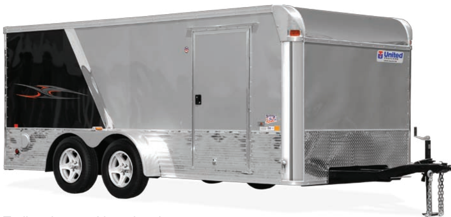
Trailer shown with optional two-tone package and aluminum star wheels