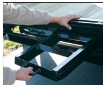
Heavy Duty Ramps – Rugged 8 ft. fabricated ramps fit neatly under the deck.