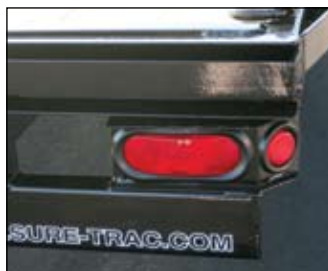
DOT Approved SEALED Lights and Conspicuity Tape