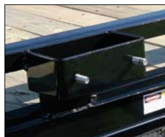
Spare Tire Holder – Securely attach a spare tire to the front of the trailer.