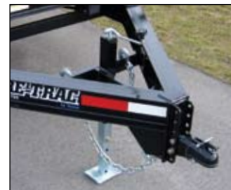
HD Frame-Mounted Jack and 2-5/16 Adjustable Coupler – Standard