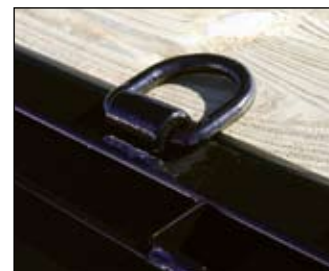
5K Lbs. D-Ring Tie Downs – Comes standard with Six Heavy Duty D-rings.