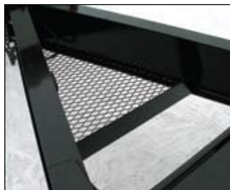
Mesh Open Tool Storage – Optional on all sizes.