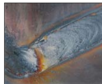
Full Seam Welds – All frame cuts welded front and back for maximum performance and longevity.