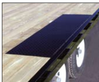
Stake Pockets & Rub Rail – Heavy duty design provides expandability and protection on side loading jobs.